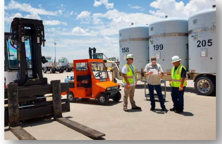
WIPP waste handling personnel review a procedure as part of prestart activities at WIPP.

Prestart activities are continuing at the Waste Isolation Pilot Plant (WIPP) as employees verify and validate operating procedures in preparation for resuming transuranic waste emplacement operations at WIPP. On June 1 WIPP workers began the phase of prestart activities referred to as Cold Operations. Cold Operations includes verifying adequacy of procedures and equipment operability; and allows operators to regain proficiency with both. These activities are all conducted in a controlled environment using simulated waste containers.